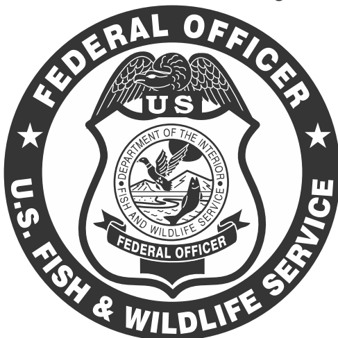
Product #14208 Federal Officer Belt Badge