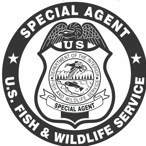
Product #7643 Special Agent Belt Badge